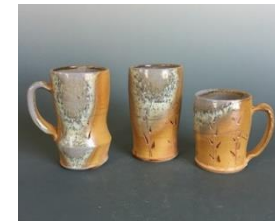
Prescott Hill Pottery 261 Prescott Hill Rd Liberty