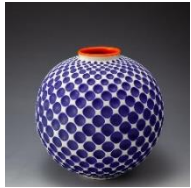
Van der Ven Studios 27 Moss Meadow Rd Lincolnton