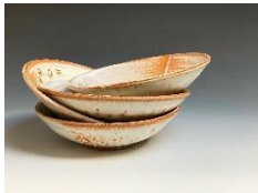
Fireside Pottery 1478 Camden Rd Warren