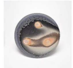
EC Ceramics 68 Popple Lane Blue Hill