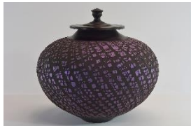
West Third Ceramics 108 Congress St Belfast