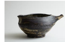
OH Pottery 66 Naskeag Rd Brooklin