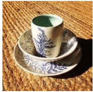
Glasser Ceramics 209 Main St Lincolnton