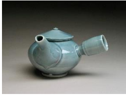
Tyler Gulden Ceramics 45 Clarks Cove Rd Walpole