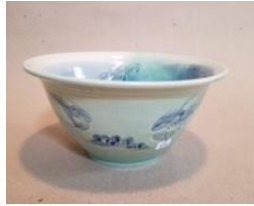
Mainly Pottery 181 Searport Ave Belfast