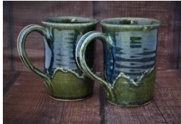
Dragon's Breath Pottery 271 Depot Rd Warren